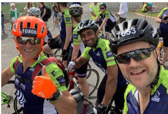
The Atlas Peloton was at its biggest with 70 riders on a fantastic day in Cambridgeshire.

With 70 riders including five internationals in the Atlas Peloton, this was our best year yet, particularly due to our largest ever entry of women riders, one of whom was the first rider home.