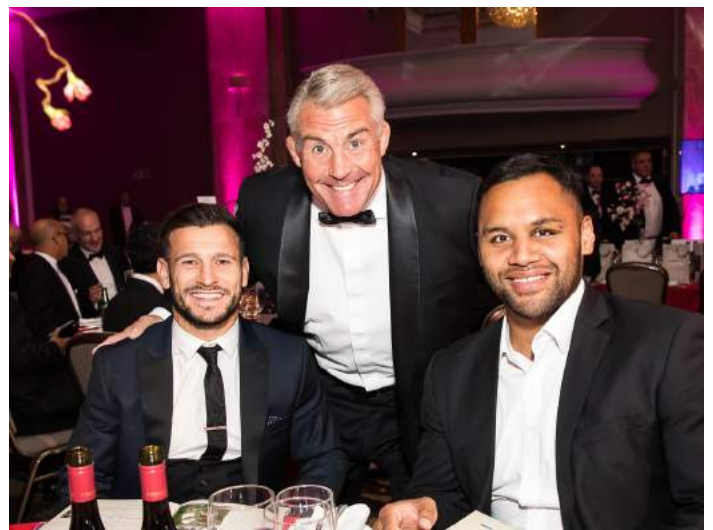
Atlas Chairman, Jason Leonard OBE, with England Internationals Danny Care and Billy Vunipola at the 2018 Jason Leonard Fundraising Dinner.

Between that and the Golf, we raised over £30,000 all while enjoying the best of the glorious summer weather, often in the most outrageously bright kit.