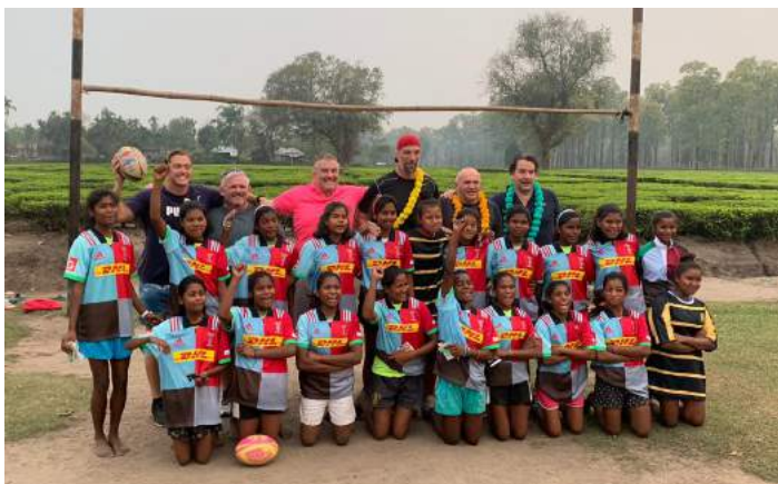
Percy Montgomery, Jason Leonard, Simon Shaw and a few of our trekkers meeting our amazing kids in Saraswatipur.

Jason Leonard was joined by Atlas Rugby Champions Simon Shaw, Percy Montgomery and ten other explorers at the end of March. Having battled India's mountain roads in vintage Land Rovers, hiked the last leg in thin air to over 4,000m, and camped overnight in very basic conditions, the team were rewarded with a stunning view of the sun rising over Everest. Visiting the Atlas project in Saraswatipur beforehand made a huge emotional impact on everyone, and became a very special part of the experience as one of our trekkers recalls: