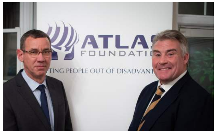
Jason Leonard OBE, Atlas Foundation Chairman, at the Israeli Embassy in London.